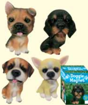
C6-1 Group Cost $1.85 Sugg. Retail $2.00-$2.25 DOG MAGNET (4 ASST.)