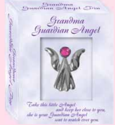
M9-2 Group Cost $3.25 Sugg. Retail $3.50-$4.00 GRANDMA GUARDIAN ANGEL PIN