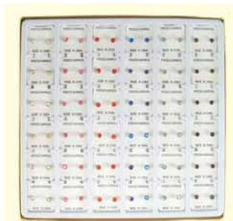
C4-3 Group Cost $0.90 Sugg. Retail $1.00-$1.25 TIFFANY EARRINGS