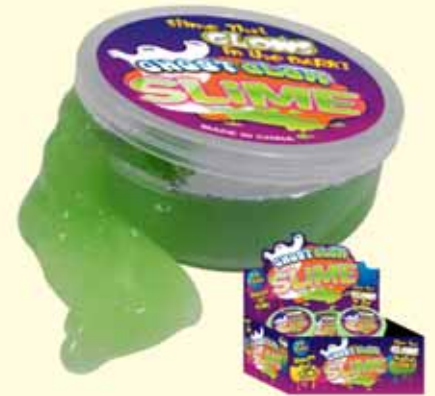
C6-3 Group Cost $1.85 Sugg. Retail $2.00-$2.25 GHOST GLOW SLIME