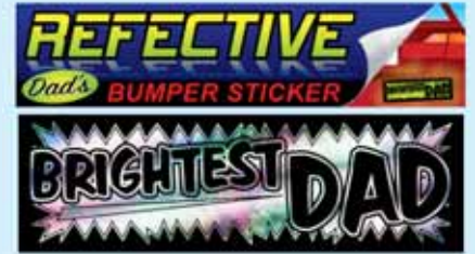
D4-1 Group Cost $0.90 Sugg. Retail $1.00-$1.25 DAD REFLECTIVE BUMPER STICKER