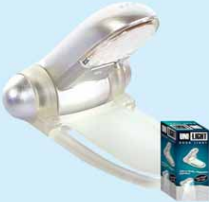
D10-4 Group Cost $3.75 Sugg. Retail $4.00-$4.50 SILVER LED BOOKLIGHT