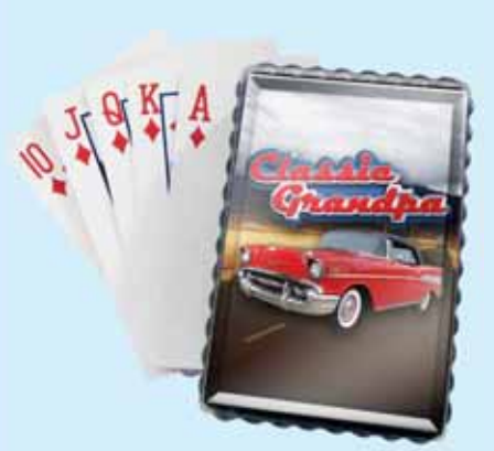
D8-2 Group Cost $2.75 Sugg. Retail $3.00-$3.25 GRANDPA PLAYING CARDS