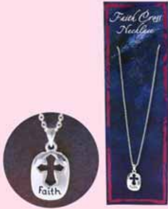
M8-4 Group Cost $2.75 Sugg. Retail $3.00-$3.25 SILVER FAITH CROSS NECKLACE