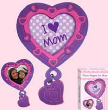
M6-1 Group Cost $1.85 Sugg. Retail $2.00-$2.25 MOM PHOTO MAGNET