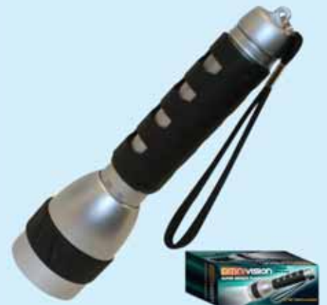
D7-3 Group Cost $2.35 Sugg. Retail $2.50-$2.75 SILVER FLASHLIGHT