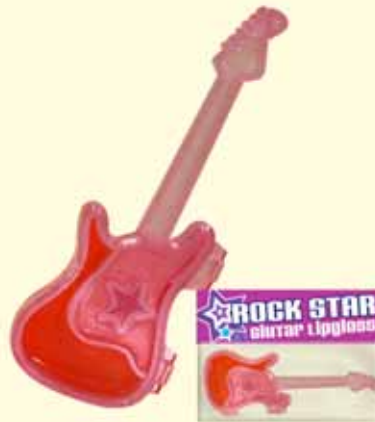
C7-1 Group Cost $2.35 Sugg. Retail $2.50-$2.75 "ROCKSTAR" GUITAR LIPGLOSS