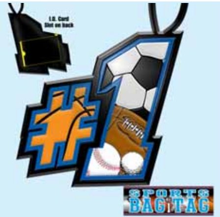
D6-4 Group Cost $1.85 Sugg. Retail $2.00-$2.25 YOU'RE #1 BAG TAG