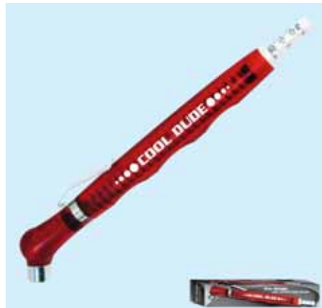
D9-3 Group Cost $3.25 Sugg. Retail $3.50-$4.00 "COOL DUDE" TIRE GAUGE