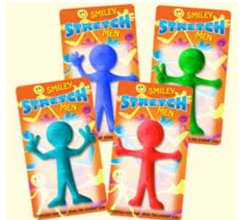
C4-1 Group Cost $0.90 Sugg. Retail $1.00-$1.25 STRETCHY MAN (3")