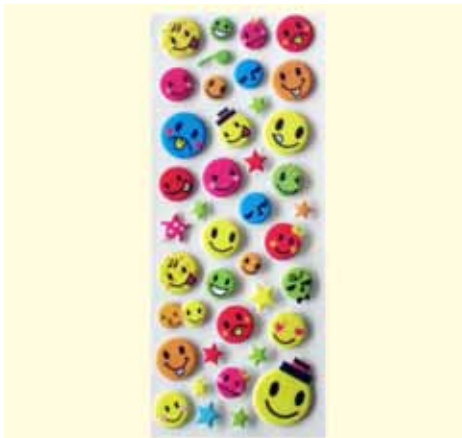
C2-1 Group Cost $0.45 Sugg. Retail $0.50 SMILE FACE STICKER SET