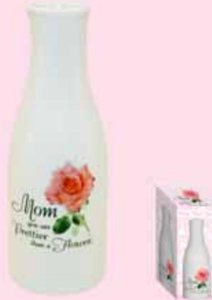
M11-2 Group Cost $4.25 Sugg. Retail $4.50-$5.00 MOM CERAMIC VASE