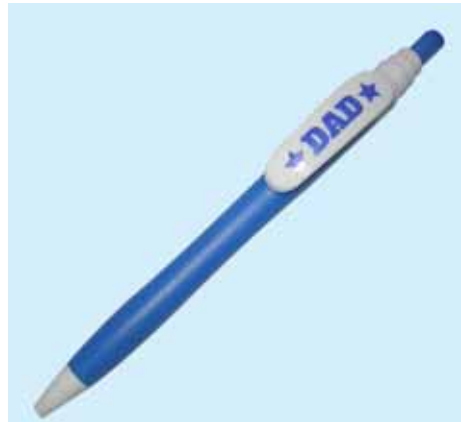
D2-1 Group Cost $0.45 Sugg. Retail $0.50 DAD PEN