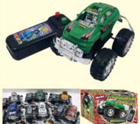
C7-2 Group Cost $2.35 Sugg. Retail $2.50-$2.75 REMOTE CONTROL MONSTER TRUCKS (6 ASST.)