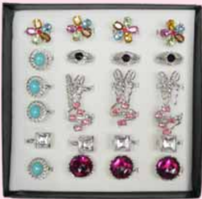
M5-4 Group Cost $1.40 Sugg. Retail $1.50-$1.75 DESIGNER RINGS