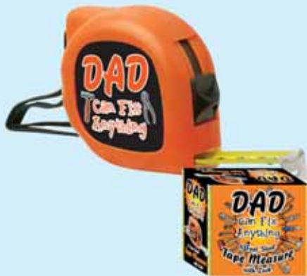
D7-1 Group Cost $2.35 Sugg. Retail $2.50-$2.75 DAD 6' TAPE MEASURE (ORANGE)