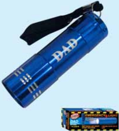
D12-1 Group Cost $4.75 Sugg. Retail $5.00-$5.50 DAD ALUMINUM EMERGENCY LIGHT (BLUE)