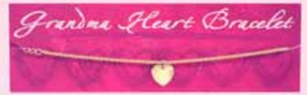
M7-4 Group Cost $2.35 Sugg. Retail $2.50-$2.75 GRANDMA GOLD HEART BRACELET