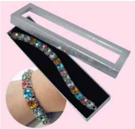
M18-1 Group Cost $9.50 Sugg. Retail $10.00-$11.00 BIG STONE BRACELET