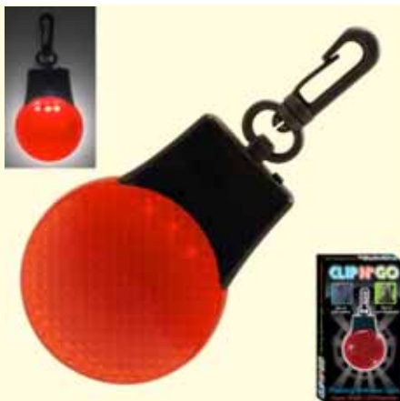
C12-1 Group Cost $4.75 Sugg. Retail $5.00-$5.50 CLIP AND GO FLASHING LIGHT