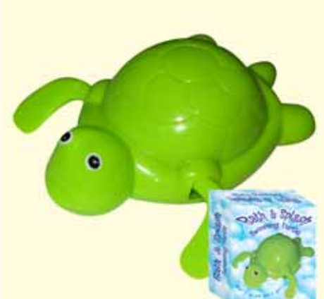
C9-3 Group Cost $3.25 Sugg. Retail $3.50-$4.00 BATH TUB TURTLE