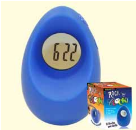
C17-1 Group Cost $8.50 Sugg. Retail $9.00-$10.00 ROCK N' CLOCK WITH ALARM (BLUE)