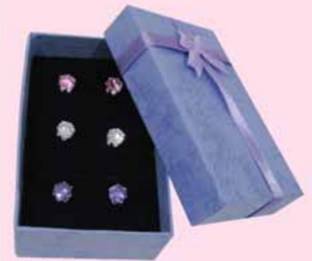
M17-1 Group Cost $8.50 Sugg. Retail $9.00-$10.00 CRYSTAL STUD EARRINGS - 3 PAIR (PINK, PURPLE, CLEAR)