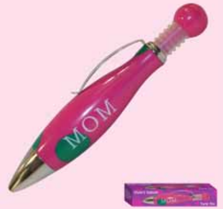
M7-1 Group Cost $2.35 Sugg. Retail $2.50-$2.75 MOM FASHION PURSE PEN (PINK)