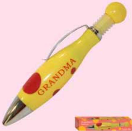
M7-2 Group Cost $2.35 Sugg. Retail $2.50-$2.75 GRANDMA FASHION PURSE PEN (YELLOW)