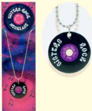
C9-1 Group Cost $3.25 Sugg. Retail $3.50-$4.00 SISTERS ROCK NECKLACE