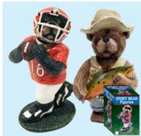
D8-4 Group Cost $2.75 Sugg. Retail $3.00-$3.25 SPORTS BEAR FIGURINES (2 ASST. FOOTBALL/FISHING)