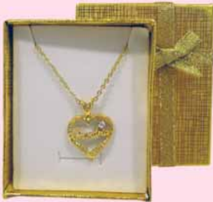
M12-2 Group Cost $4.75 Sugg. Retail $5.00-$5.50 GRANDMA GOLD HEART CRYSTAL NECKLACE