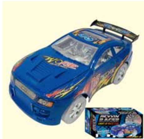
C15-1 Group Cost $6.50 Sugg. Retail $7.00-$8.00 RACE CAR W/LIGHT-UP WHEELS