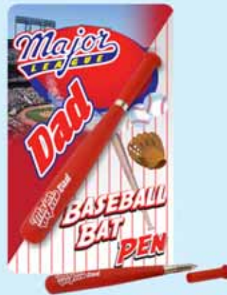
D5-1 Group Cost $1.40 Sugg. Retail $1.50-$1.75 DAD MAJOR LEAGUE PEN (RED)