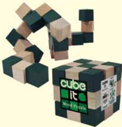
C6-4 Group Cost $1.85 Sugg. Retail $2.00-$2.25 WOOD PUZZLE GAME