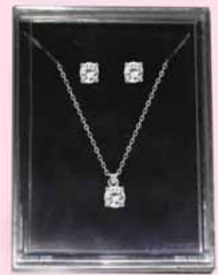
M10-4 Group Cost $3.75 Sugg. Retail $4.00-$4.50 TIFFANY JEWELRY SET (3 ASST. PINK, PURPLE, CLEAR)