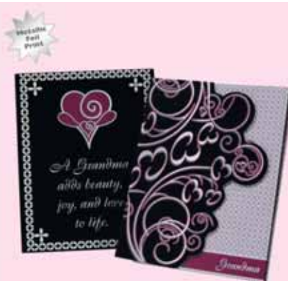
M8-2 Group Cost $2.75 Sugg. Retail $3.00-$3.25 GRANDMA FASHION NOTE PAD