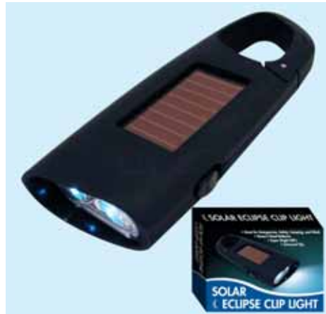
D18-1 Group Cost $9.50 Sugg. Retail $10.00-$11.00 SOLAR CLIP LIGHT (BLACK)