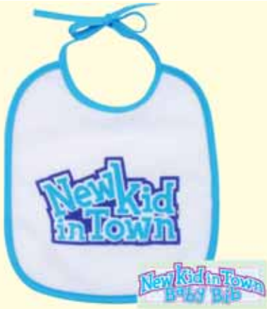
C7-3 Group Cost $2.35 Sugg. Retail $2.50-$2.75 "NEW KID IN TOWN" BABY BIB (TERRY CLOTH & PVC)