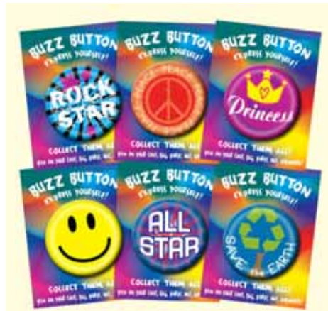
C3-1 Group Cost $0.70 Sugg. Retail $0.75 BUZZ BUTTONS (6 ASST. STYLES)