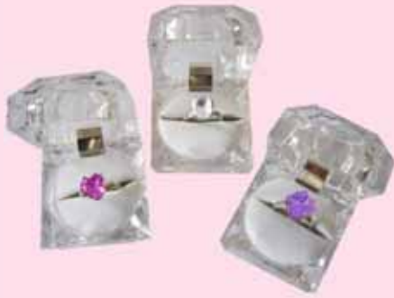
M11-1 Group Cost $4.25 Sugg. Retail $4.50-$5.00 FASHION RINGS (3 ASST. PINK, PURPLE, CLEAR)