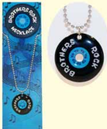
C9-2 Group Cost $3.25 Sugg. Retail $3.50-$4.00 BROTHERS ROCK NECKLACE