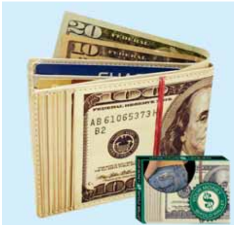
D17-1 Group Cost $8.50 Sugg. Retail $9.00-$10.00 $100 WAD WALLET