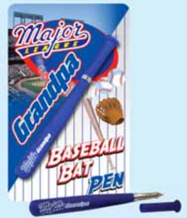
D5-2 Group Cost $1.40 Sugg. Retail $1.50-$1.75 GRANDPA MAJOR LEAGUE PEN (BLUE)