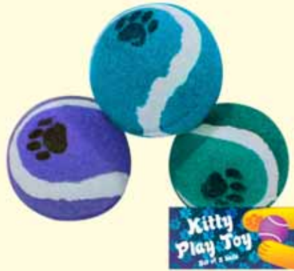
C9-5 Group Cost $3.25 Sugg. Retail $3.50-$4.00 CAT TENNIS BALLS (SET OF 3)