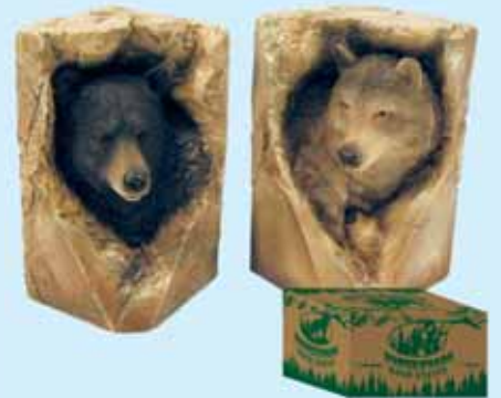
D13-1 Group Cost $5.25 Sugg. Retail $5.50-$6.00 NORTHWOODS STATUE (2 ASST.)