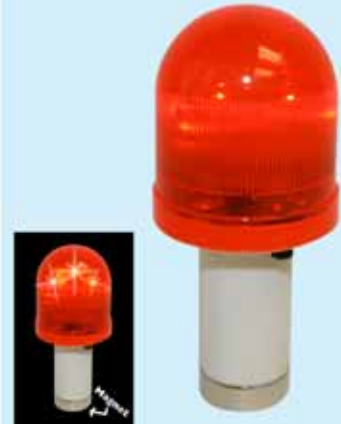
D16-1 Group Cost $7.50 Sugg. Retail $8.00-$9.00 4" MAGNETIC EMERGENCY LIGHT