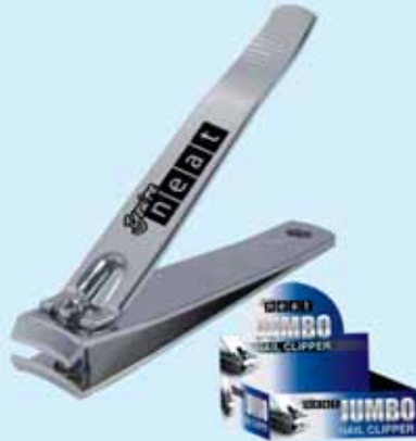
D6-3 Group Cost $1.85 Sugg. Retail $2.00-$2.25 JUMBO NAIL CLIPPER