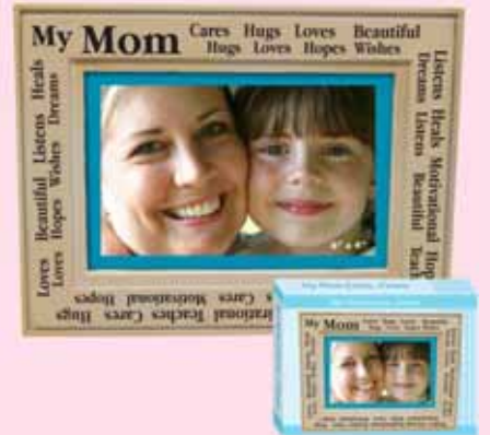
M14-1 Group Cost $5.75 Sugg. Retail $6.00-$7.00 MOM WOOD-LOOK FRAME