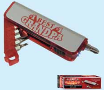
D11-2 Group Cost $4.25 Sugg. Retail $4.50-$5.00 GRANDPA TOOL KIT (BLACK)