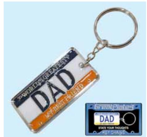
D9-1 Group Cost $3.25 Sugg. Retail $3.50-$4.00 DAD LICENSE PLATE KEYCHAIN