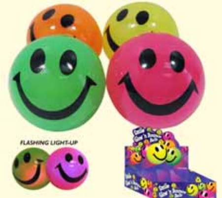
C8-1 Group Cost $2.75 Sugg. Retail $3.00-$3.25 SMILE GLOW 'N BOUNCE BALL (4 ASST. COLORS)