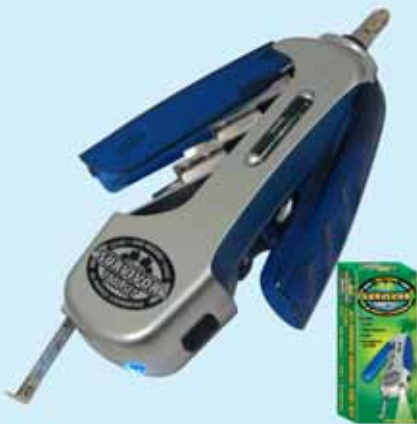
D15-1 Group Cost $6.50 Sugg. Retail $7.00-$8.00 SURVIVAL TOOL KIT