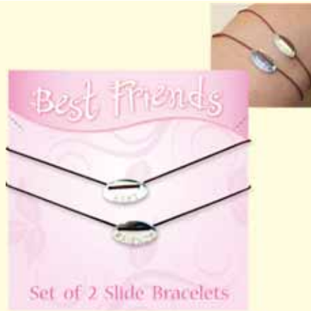
C7-4 Group Cost $2.35 Sugg. Retail $2.50-$2.75 BEST FRIENDS SLIDE BRACELET S/2