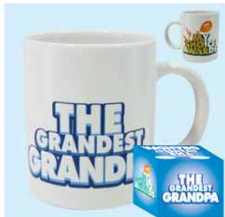
D10-2 Group Cost $3.75 Sugg. Retail $4.00-$4.50 GRANDPA "THE GRANDEST" MUG