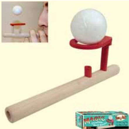
C8-2 Group Cost $2.75 Sugg. Retail $3.00-$3.25 MAGIC FLOATING BALL GAME