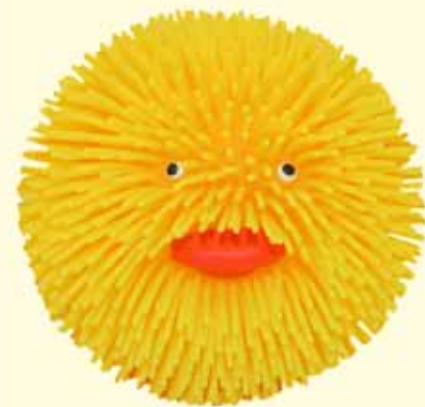
C12-2 Group Cost $4.75 Sugg. Retail $5.00-$5.50 FUZZY ANIMAL BALL - 4"