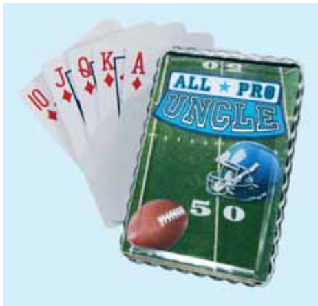
D8-3 Group Cost $2.75 Sugg. Retail $3.00-$3.25 UNCLE PLAYING CARDS