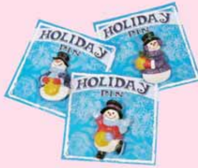
M6-4 Group Cost $1.85 Sugg. Retail $2.00-$2.25 SNOWMAN HOLIDAY PIN (3 ASST.)