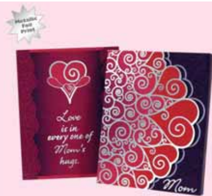
M8-1 Group Cost $2.75 Sugg. Retail $3.00-$3.25 MOM FASHION NOTE PAD