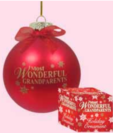
M9-3 Group Cost $3.25 Sugg. Retail $3.50-$4.00 GRANDPARENTS CHRISTMAS ORNAMENT