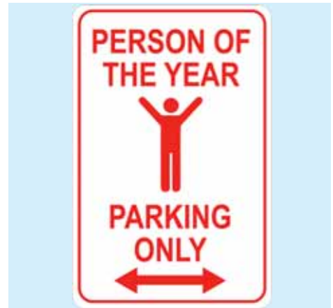
D9-4 Group Cost $3.25 Sugg. Retail $3.50-$4.00 "PERSON OF THE YEAR" PARKING SIGN (16.5" H)