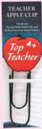
M6-3 Group Cost $1.85 Sugg. Retail $2.00-$2.25 TEACHER APPLE CLIP