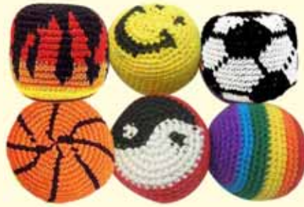
C5-3 Group Cost $1.40 Sugg. Retail $1.50-$1.75 2" CROCHET KICK BALL (6 ASST. STYLES)