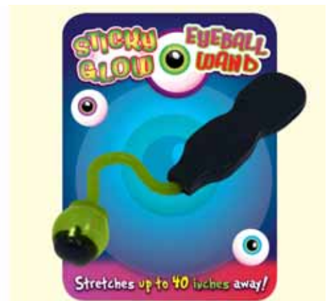
C5-1 Group Cost $1.40 Sugg. Retail $1.50-$1.75 GLOW STICKY EYEBALL WAND