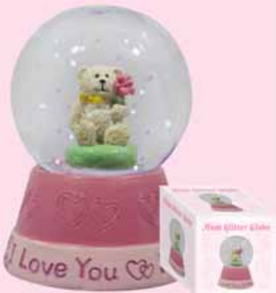
M15-1 Group Cost $6.50 Sugg. Retail $7.00-$8.00 MOM GLITTER WATERBALL