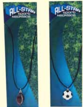
C11-2 Group Cost $4.25 Sugg. Retail $4.50-$5.00 SPORT NECKLACES (2 ASST. SOCCER, FOOTBALL)