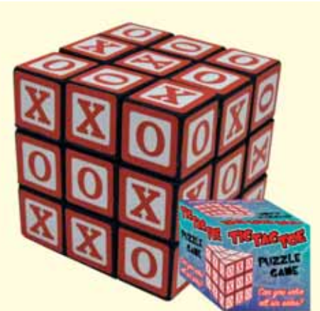
C8-4 Group Cost $2.75 Sugg. Retail $3.00-$3.25 TIC TAC TOE PUZZLE CUBE