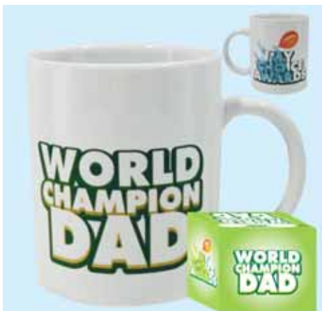
D10-1 Group Cost $3.75 Sugg. Retail $4.00-$4.50 DAD "WORLD CHAMPION" MUG