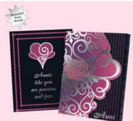
M8-3 Group Cost $2.75 Sugg. Retail $3.00-$3.25 AUNT FASHION NOTE PAD