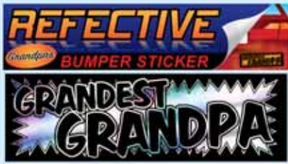
D4-2 Group Cost $0.90 Sugg. Retail $1.00-$1.25 GRANDPA REFLECTIVE BUMPER STICKER