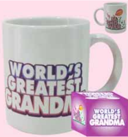
M10-2 Group Cost $3.75 Sugg. Retail $4.00-$4.50 GRANDMA "WORLD'S GREATEST" MUG