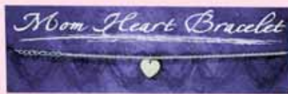
M7-3 Group Cost $2.35 Sugg. Retail $2.50-$2.75 MOM SILVER HEART BRACELET