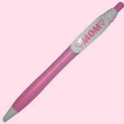
M2-1 Group Cost $0.45 Sugg. Retail $0.50 MOM PEN