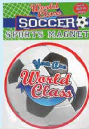
D5-4 Group Cost $1.40 Sugg. Retail $1.50-$1.75 "YOU'RE WORLD CLASS" JUMBO SOCCER MAGNET