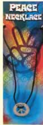
C6-2 Group Cost $1.85 Sugg. Retail $2.00-$2.25 PEACE NECKLACE