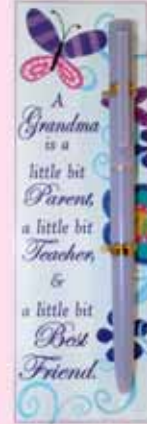
M4-2 Group Cost $0.90 Sugg. Retail $1.00-$1.25 GRANDMA BOOKMARK W/PEN