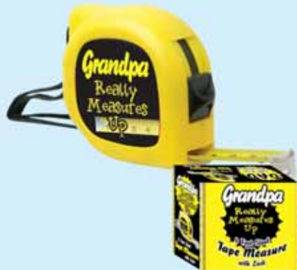
D7-2 Group Cost $2.35 Sugg. Retail $2.50-$2.75 GRANDPA 6' TAPE MEASURE (YELLOW)