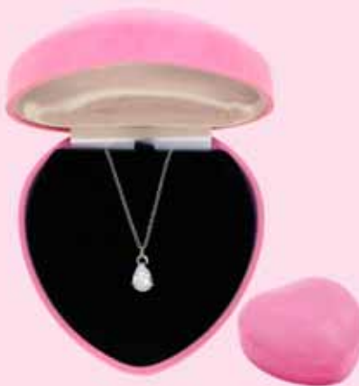
M16-1 Group Cost $7.50 Sugg. Retail $8.00-$9.00 CRYSTAL TEAR DROP NECKLACE