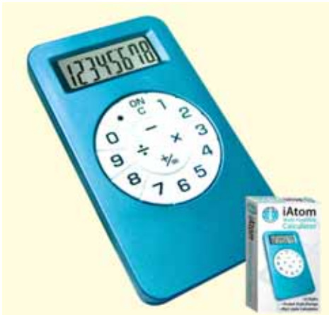
C14-1 Group Cost $5.75 Sugg. Retail $6.00-$7.00 MUSIC PLAYER STYLE CALCULATOR