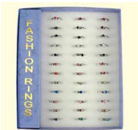
C4-2 Group Cost $0.90 Sugg. Retail $1.00-$1.25 TIFFANY RINGS