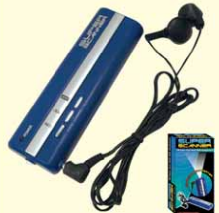
C13-1 Group Cost $5.25 Sugg. Retail $5.50-$6.00 SUPER SCAN RADIO W/LIGHT (BLUE)