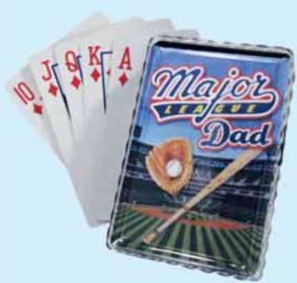
D8-1 Group Cost $2.75 Sugg. Retail $3.00-$3.25 DAD PLAYING CARDS