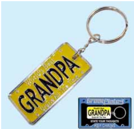
D9-2 Group Cost $3.25 Sugg. Retail $3.50-$4.00 GRANDPA LICENSE PLATE KEYCHAIN