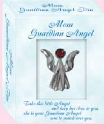
M9-1 Group Cost $3.25 Sugg. Retail $3.50-$4.00 MOM GUARDIAN ANGEL PIN