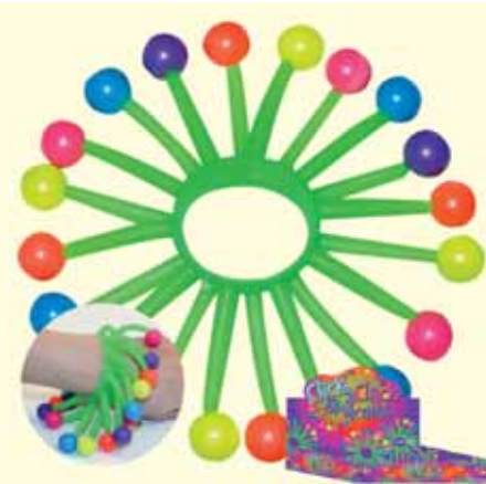
C8-3 Group Cost $2.75 Sugg. Retail $3.00-$3.25 CLACKER BRACELET