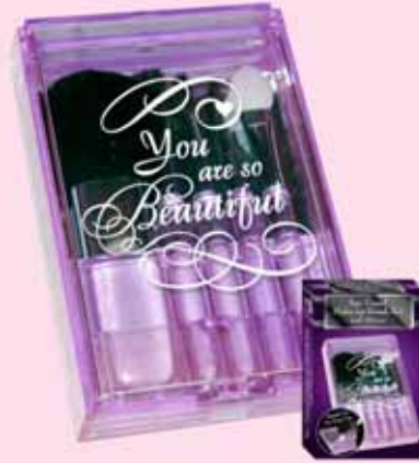
M9-4 Group Cost $3.25 Sugg. Retail $3.50-$4.00 5PC TRAVEL MAKE-UP BRUSH KIT W/MIRROR