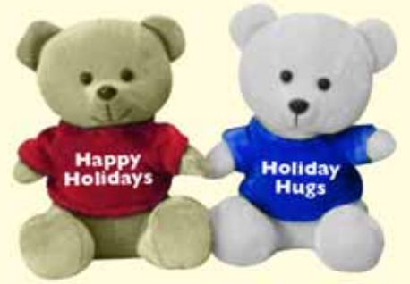
C10-1 Group Cost $3.75 Sugg. Retail $4.00-$4.50 PLUSH HOLIDAY BEAR 7"