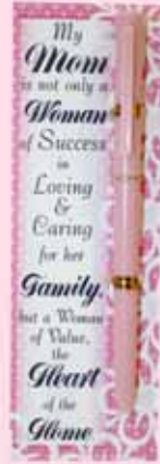
M4-1 Group Cost $0.90 Sugg. Retail $1.00-$1.25 MOM BOOKMARK W/PEN