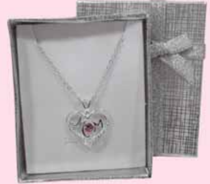
M12-1 Group Cost $4.75 Sugg. Retail $5.00-$5.50 MOM SILVER HEART CRYSTAL NECKLACE