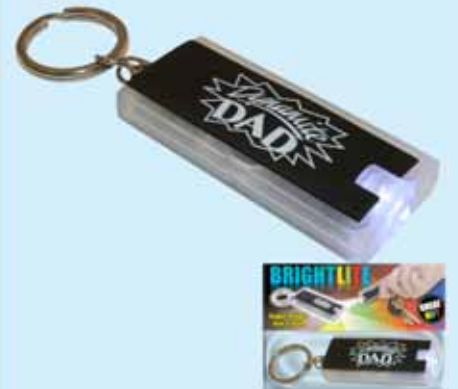
D6-1 Group Cost $1.85 Sugg. Retail $2.00-$2.25 DAD BRITE LITE KEY CHAIN (BLACK)