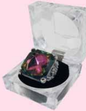
M13-1 Group Cost $5.25 Sugg. Retail $5.50-$6.00 JUMBO BLING RING