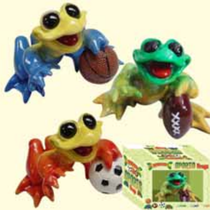
C11-1 Group Cost $4.25 Sugg. Retail $4.50-$5.00 SPORTS FROGS (3 ASST.)