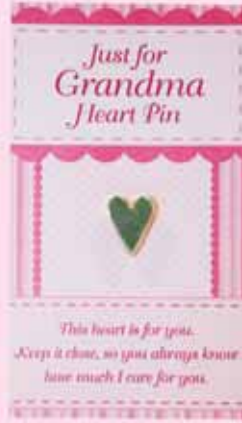
M5-2 Group Cost $1.40 Sugg. Retail $1.50-$1.75 GRANDMA GOLD HEART PIN