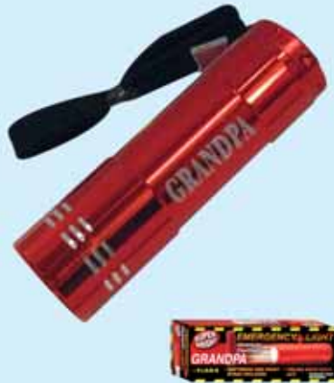
D12-2 Group Cost $4.75 Sugg. Retail $5.00-$5.50 GRANDPA ALUMINUM EMERGENCY LIGHT (RED)