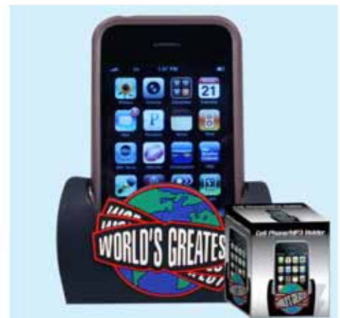
D10-3 Group Cost $3.75 Sugg. Retail $4.00-$4.50 "WORLD'S GREATEST" CELL PHONE HOLDER