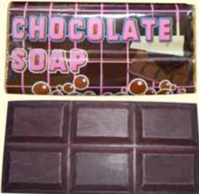
C10-2 Group Cost $3.75 Sugg. Retail $4.00-$4.50 CHOCOLATE SOAP