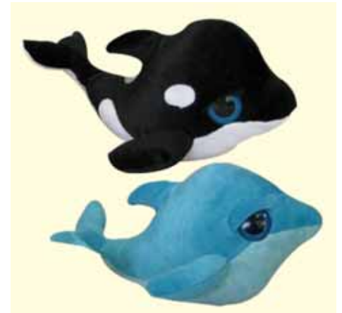
C16-1 Group Cost $7.50 Sugg. Retail $8.00-$9.00 BABY DOLPHIN & WHALE PLUSH 10" (2 ASST.)