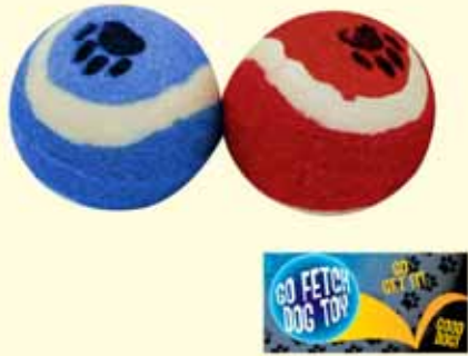
C9-4 Group Cost $3.25 Sugg. Retail $3.50-$4.00 DOG TENNIS BALLS (SET OF 2)