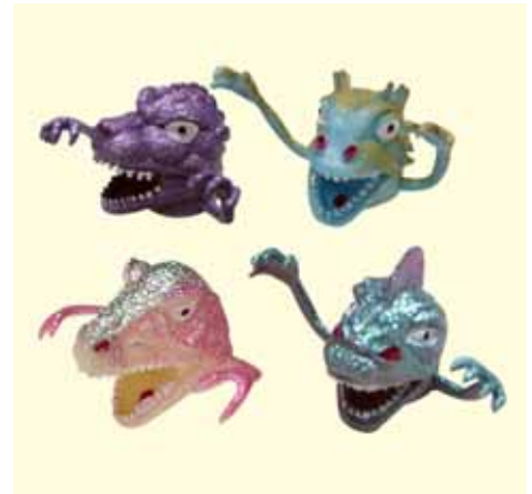
C1-1 Group Cost $0.23 Sugg. Retail $0.25 MONSTER FINGER PUPPETS (ASST.)