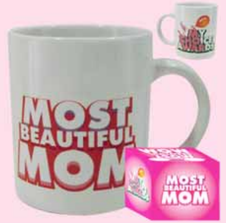
M10-1 Group Cost $3.75 Sugg. Retail $4.00-$4.50 MOM "MOST BEAUTIFUL" MUG