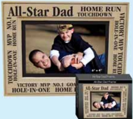
D14-1 Group Cost $5.75 Sugg. Retail $6.00-$7.00 DAD WOOD-LOOK SPORTS FRAME