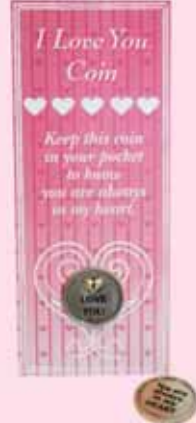
M5-3 Group Cost $1.40 Sugg. Retail $1.50-$1.75 I LOVE YOU COIN