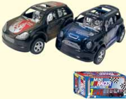
C5-2 Group Cost $1.40 Sugg. Retail $1.50-$1.75 CHAMPION RACE CARS (2 ASST. RED/BLUE)