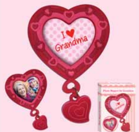
M6-2 Group Cost $1.85 Sugg. Retail $2.00-$2.25 GRANDMA PHOTO MAGNET