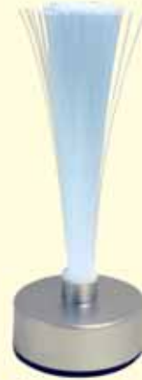
C5-4 Group Cost $1.40 Sugg. Retail $1.50-$1.75 FIBER OPTIC LIGHT