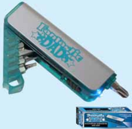
D11-1 Group Cost $4.25 Sugg. Retail $4.50-$5.00 DAD TOOL KIT (BLUE)