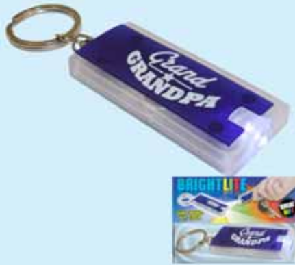
D6-2 Group Cost $1.85 Sugg. Retail $2.00-$2.25 GRANDPA BRITE LITE KEY CHAIN (BLUE)