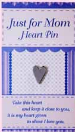
M5-1 Group Cost $1.40 Sugg. Retail $1.50-$1.75 MOM SILVER HEART PIN